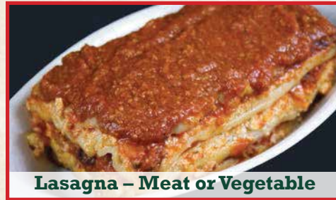
Lasagna – Meat or Vegetable